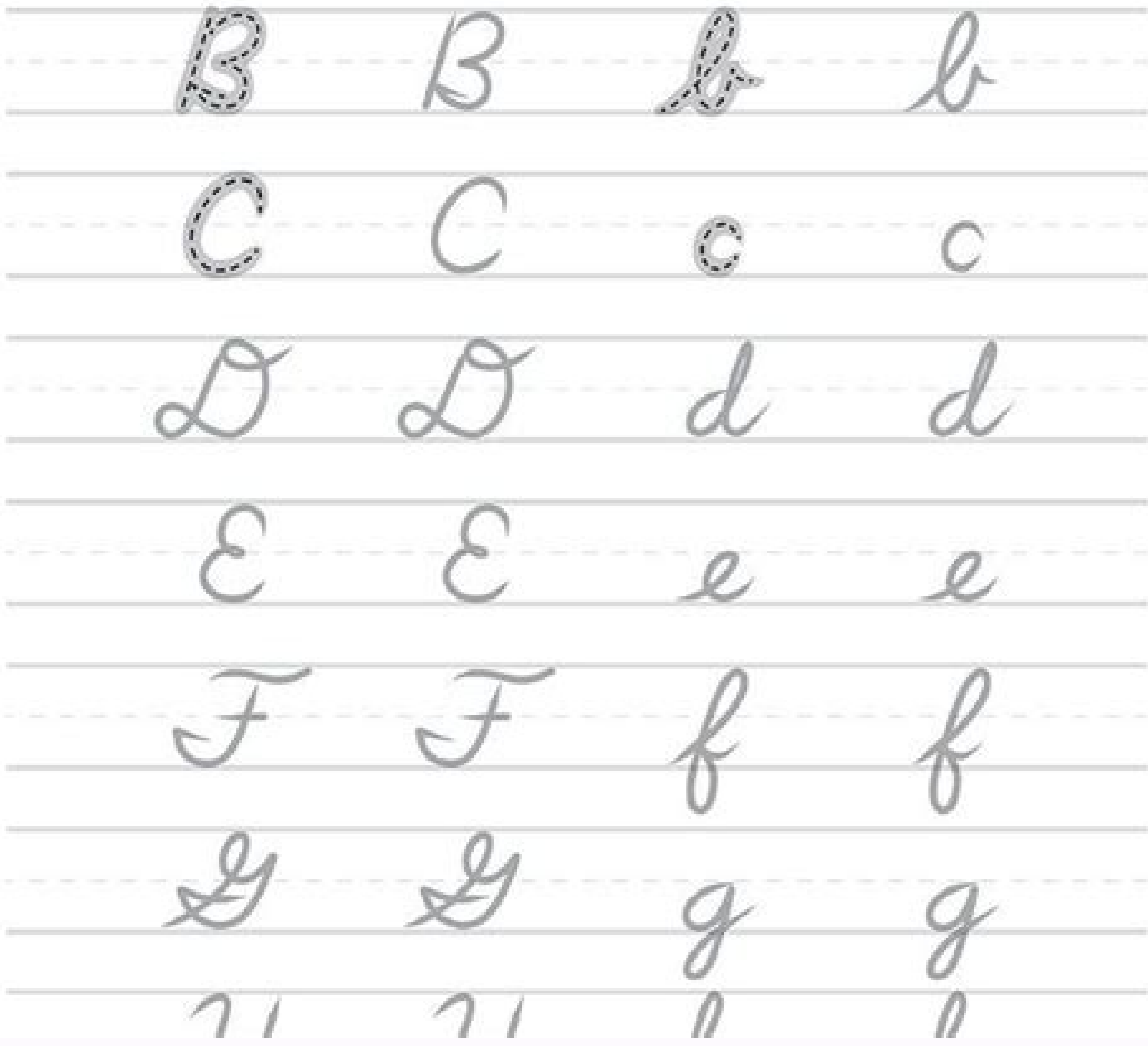
Cursive writing practice sheets a-z free. Cursive writing practice sheets a-z free download.